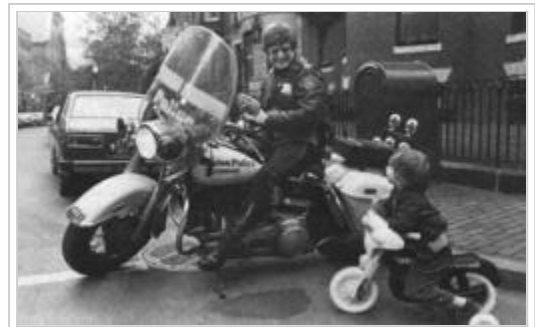
Figure 3. In this picture, the child is modeling the behavior of the adult. Children watch and imitate the adults around them; the result may be favorable or unfavorable behavior!

Shaping is the process of gradually changing the quality of a response. The desired behavior is broken down into discrete, concrete units, or positive movements, each of which is reinforced as it progresses towards the overall behavioral goal. In the following scenario, the classroom teacher employs shaping to change student behavior: the class enters the room and sits down, but continue to talk after the bell rings. The teacher gives the class one point for improvement, in that all students are seated. Subsequently, the students must be seated and quiet to earn points, which may be accumulated and redeemed for rewards.